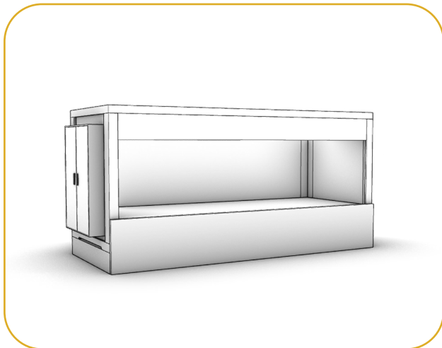
The Experience | Basic module

Large containers designed exclusively for ample exhibition spaces that have wide doors and sufficient logistical capacity.