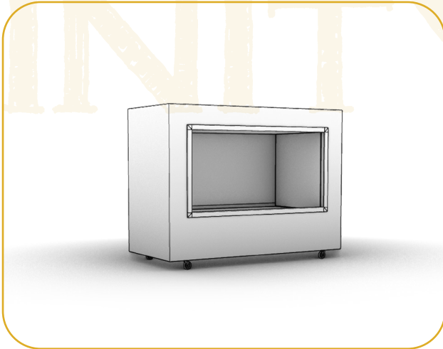
The Essence I Basic module

A compact module made up of reduced-size containers and foldable structures that can adapt to any kind of room with doors measuring 1.20x2.10 m.